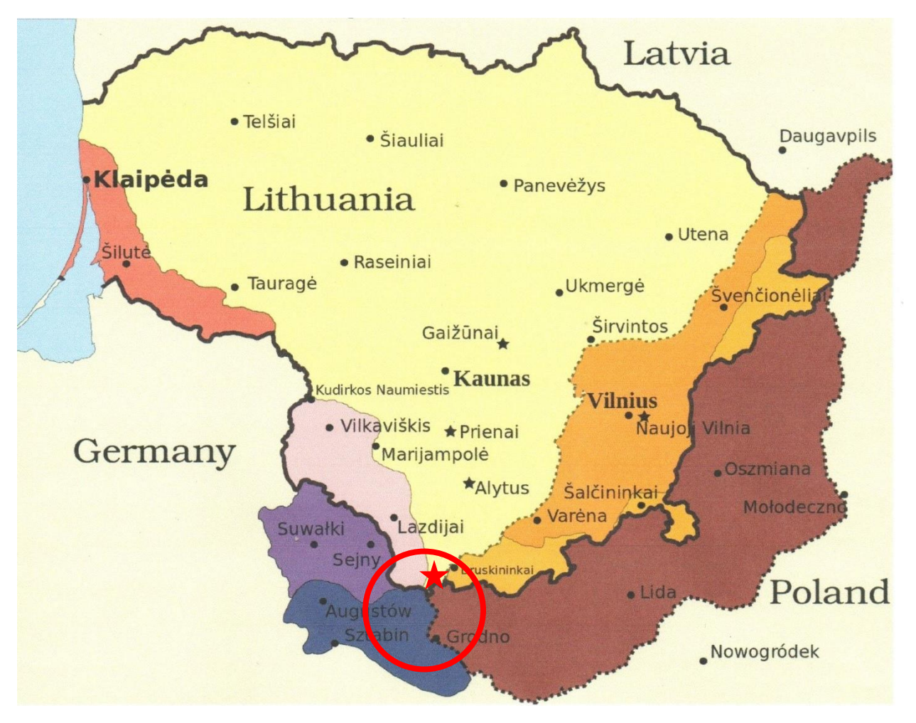
Venue. Vilnius Academy of Arts invites in the practice center in Mizarai village, which is located at the intersection of three states – Lithuania, Poland and Belarus. The campus is the former summer residence of the ceramic factory "Jiesia", located on the river Nemunas, drowned in lush forests, near the famous SPA resort Druskininkai.

compounded by other social problems, such as the lack of an open and active civil society and civic initiatives, and a weak NGO sector.